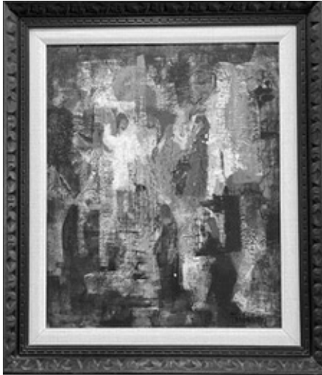
Boy Jesus in the Temple